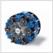
[1] MAGPOWR High Efficiency Brake (HEB250) [1]