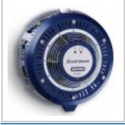
[2] MAGPOWR Smart Brake [2]