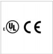
[3] UL and CE Approved [3]